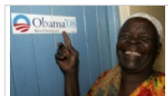
Slideshow: Meet the Obamas in Kogelo, Kenya