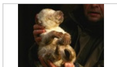
Video: The next Knut to be raised by hand

Reuters.com: Help and Contact Us | Advertise With Us | Mobile | Newsletters | RSS | Interactive TV | Labs | Reuters in Second Life | Archive | Site Index | Video Index