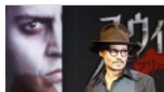
What is Johnny Depp made of? Frogs' legs!